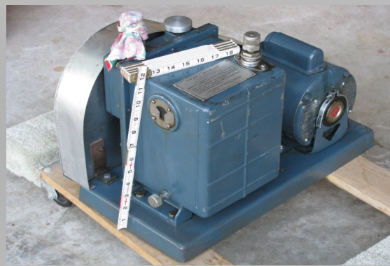
DuoSeal Vacuum Pump—Approximately a 60 lbs monster

I hope to be able to make another trip to his place in July for a couple of days for some hollowing lessons. One of his many specialties are his Christmas ornaments of which he has made and sold thousands of them.