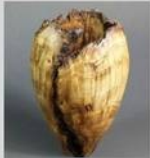
Distressed Vessel, Elm Dale Bright