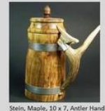
Stein, Maple, 10 x 7, Antler Handle Chance Hustin